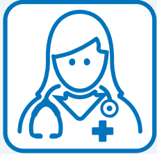
Healthcare Access & Delivery (Including Oral Health)

$3.3 Million invested to address unmet health needs and improve the health of the people in our community.