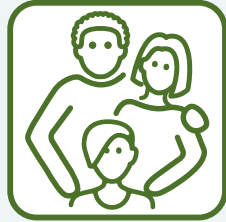
Behavioral Health (Including Domestic Violence & Trauma)