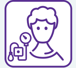
Chronic Conditions (Other than Diabetes & Obesity)