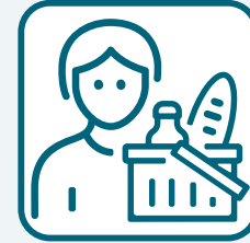
Economic Stability (Including Food Insecurity, Housing & Homelessness)