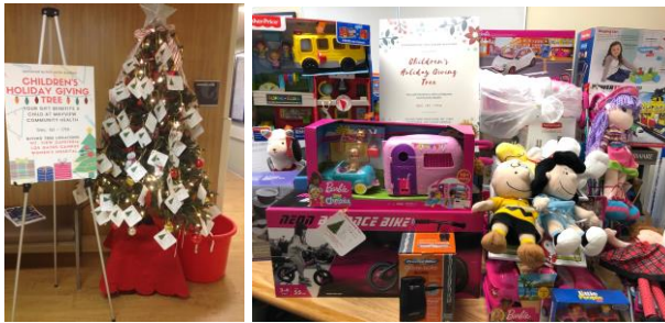
Los Gatos Giving Tree and Collected Gifts

Thanks to the generosity of the El Camino community, we were able to deliver these gifts to the patients at the MayView Community Health Center. MayView is a nonprofit primary care clinic devoted to providing healthcare to low-income families throughout Santa Clara County.